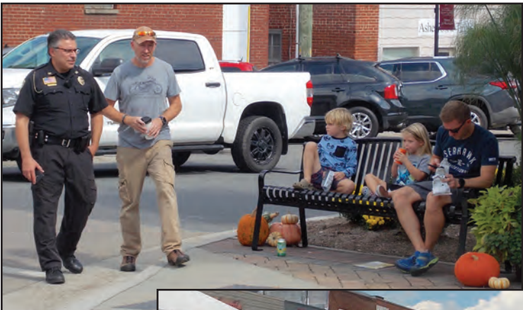
and more from last year...