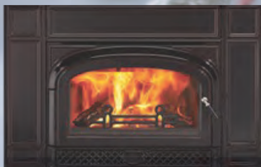
VERMONT CASTINGS MONTEPELIER II WOOD INSERT. MOJOLICA BROWN WITH SURROUND MONTPIIBM

Merry Christmas! —from All of Us at Parker Tie